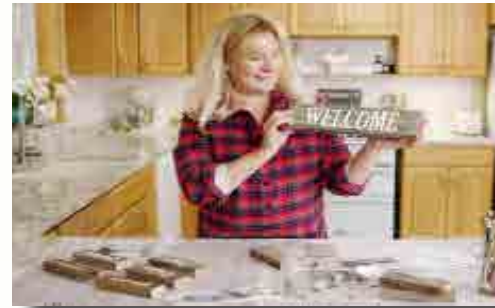
WELCOME TO MY FARM