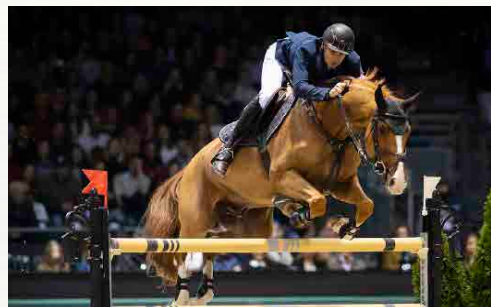
FEI JUMPING WORLD CUP