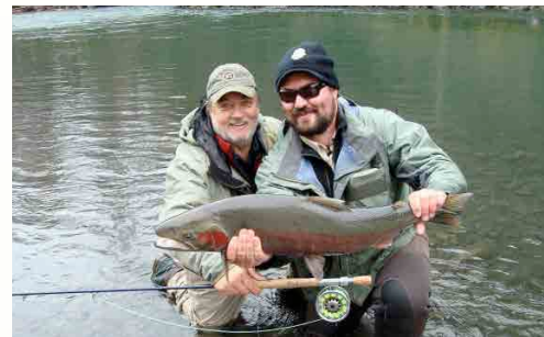
NICE FISH ON THE FLY